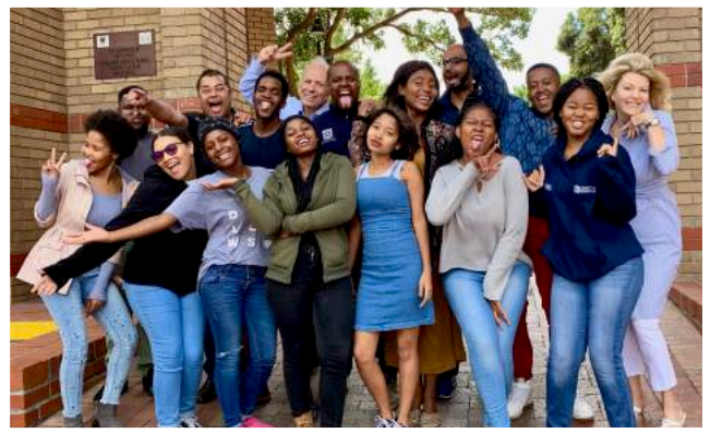
University of the Western Cape (Cape Town)