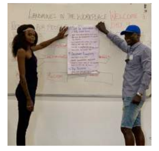
Discussing “landmines in the workplace”. We have all experienced them.