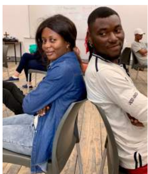
Interactive activities help stimulate learning and build confidence