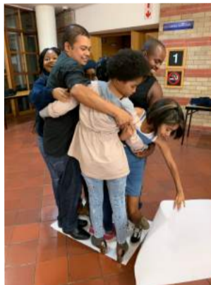
Engaging and fun “Seven on the mat”