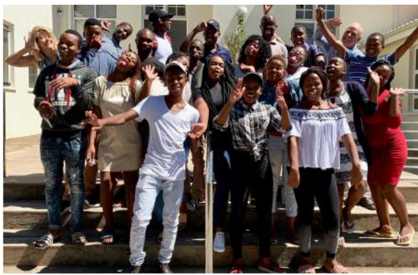
University of Fort Hare (Alice, Eastern Cape)

Students say “ Pathway for Life ” continues to be a vital part of their personal growth and development.