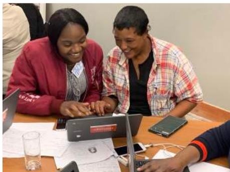
Developing computer skills to set up a gmail account and create CV