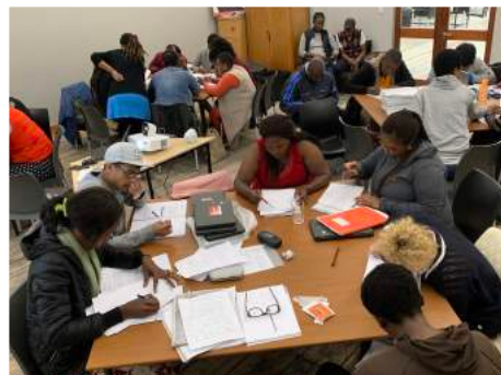
Working on their Curriculum Vitae Resume as we say in the US of A