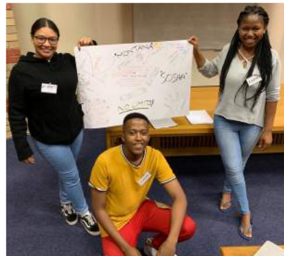
Presenting group findings helps develop confidence in oral communication