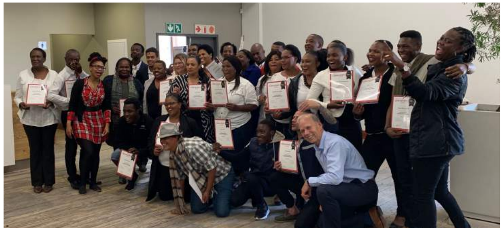
Graduates beam with hope for the future