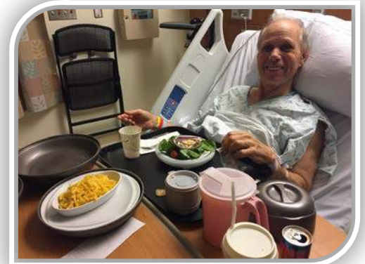
“Happy Days are here again!”