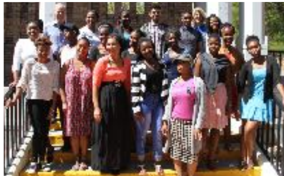
An enthusiastic group of 2014-16 "PFL" grads take it to the next level in "Beyond the Path"