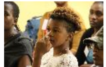
Students are briefed in various leadership styles and ponder the concept of servant leadership