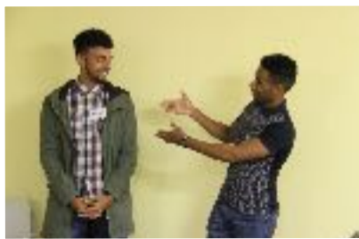
Students practice public speaking and social skills by introducing a classmate to the rest of the class.

"PFL" grads take it to the next level in 2017!