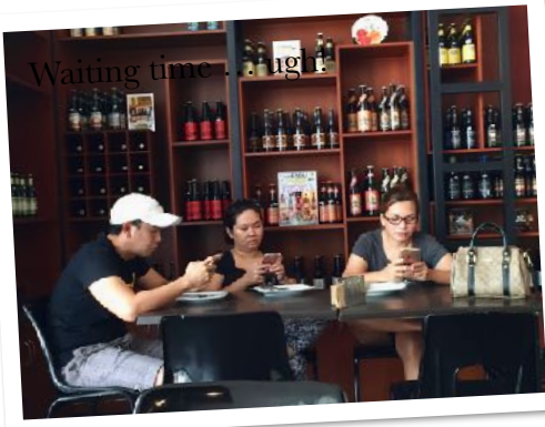
Waiting time... right! Students recognize relationships are built face to face.

Here's an example of how technology has taken the focus to the face of the device. What is being communicated here? Who/what is more important?