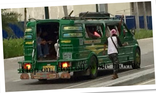
Hop on, hop off, while moving!