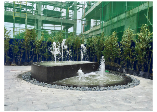
Before and After photo of a new water feature - only a few days to complete