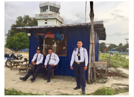
Old airport runway and tower being converted to a subdivision