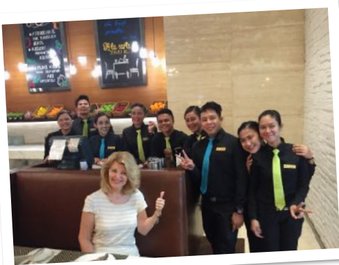
Great restaurant staff at the Richmond Hotel Iloilo City demonstrate Filipino style service