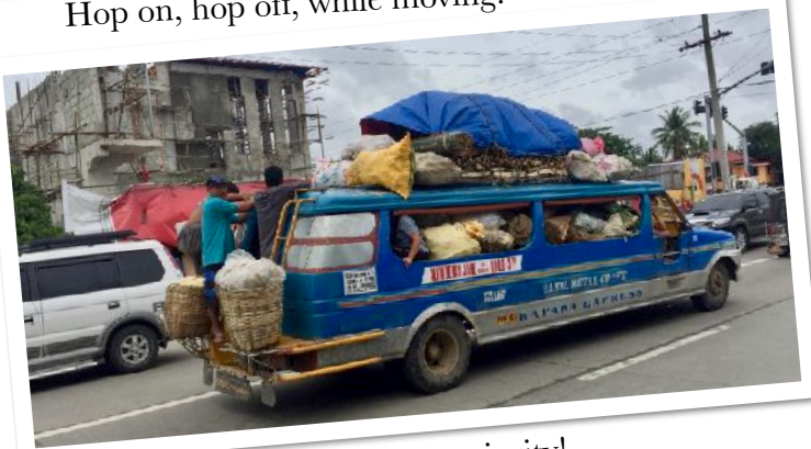
Goods take priority!