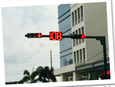
Traffic waiting time ... ugh!